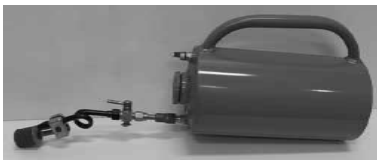
FCT2 - Retractable Wand 5lt