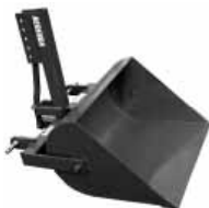
Berends & Farm-Aid

FA400 FARM-AID 1/2 yard capacity 1180x610x460mm (100kg)